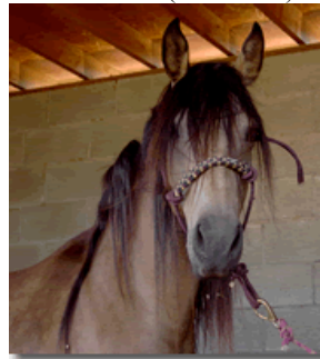
1676 Tosana (Cielos)

Grey horses can carry many color genes including the Crème gene. Buckskin – help in predicting the foal's color.