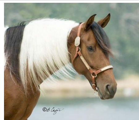
Tapixaba do Vale Vermelho – first embryo donor.