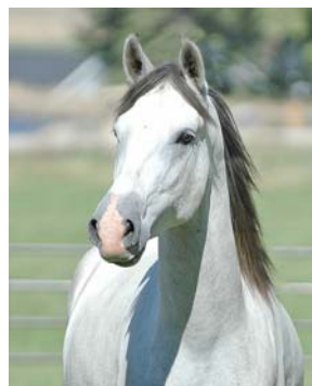
Grao Mestre (4Seasons)

"Equus" August issue "Trail Rider" November issue "Conquistador" Fall issue Feature Article