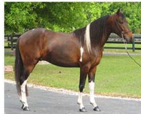
Casablanca do Premier – Tapixaba's foal, featured at the Ocala Expo