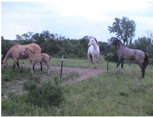
A Marchador Meeting at Flying Oaks.