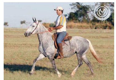
Another good profile shot with rider. Shown is Belina D.F.D of Haras Selva Morena. www.selvamorena.com.br