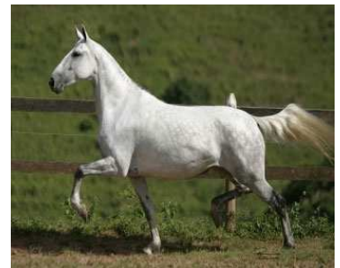
A good example of a profile shot. Shown is Heranca do Ipeago of Haras Ipeago. www.harasipeago.com.br