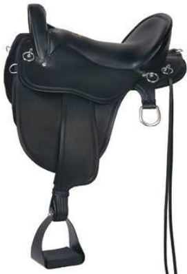
Tucker Trail / Plantation style saddle