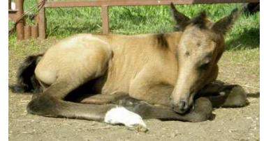
New Marchador foals should be registered within 6 months of birth to avoid incurring late filing fees.