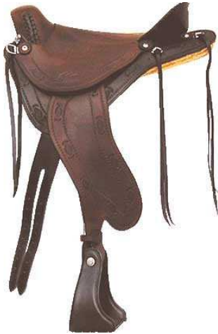
Synergist endurance style saddle.