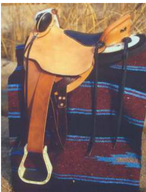
Boz Slick Fork Bone Sport Agility saddle